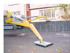
Easy set up